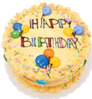
The Maryland Outdoor Club celebrates its first birthday!