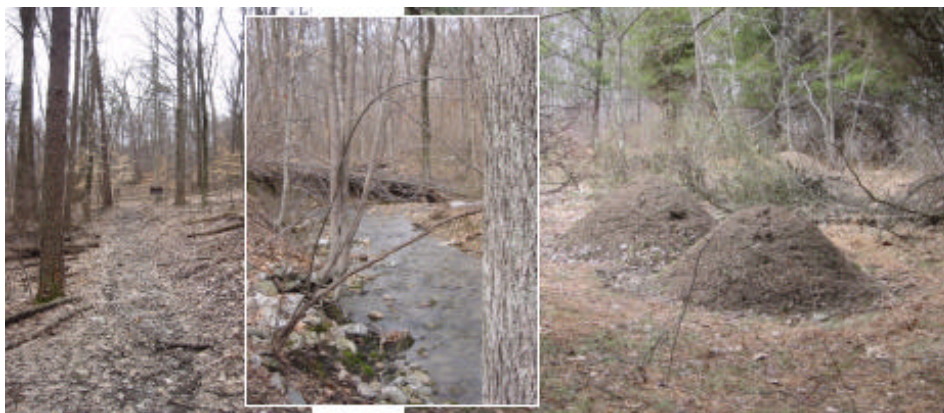
March 23rd Easy Loop Day Hike in Clarksburg, MD. Left to Right: View of the Trail, Stoney Brook, and the Huge Anthills. There were hundreds of anthills around, even some right on the trail.