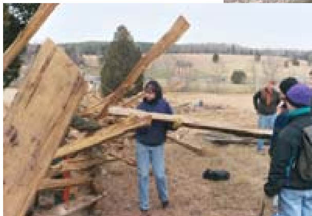
Why are all the guys just standing around watching while the girl does the work?