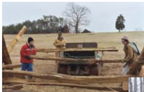
Thankfully, modern technology is allowed at these old battlefields.