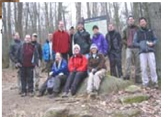
The group at Old Rag can truly smile afterwards.